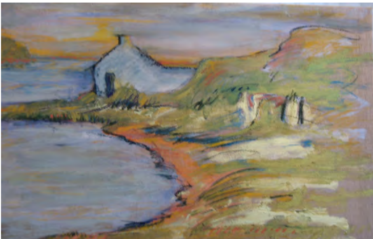
Jethro Tulls Boathouse, Scotland