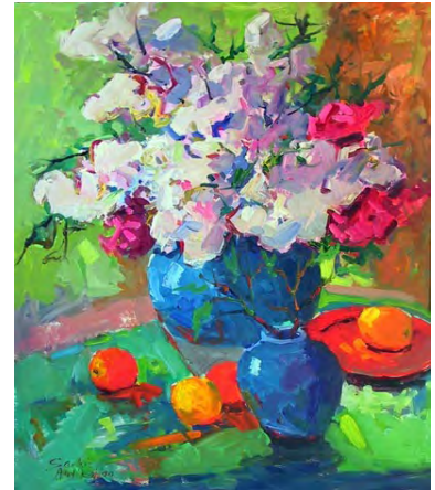
White flowers, blue vase