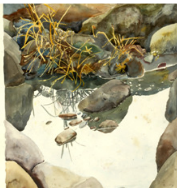
Tide Pool, Watercolor by Judy Findley