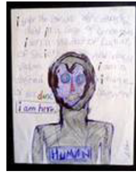
Artwork by inmates from the Oregon Correctional System