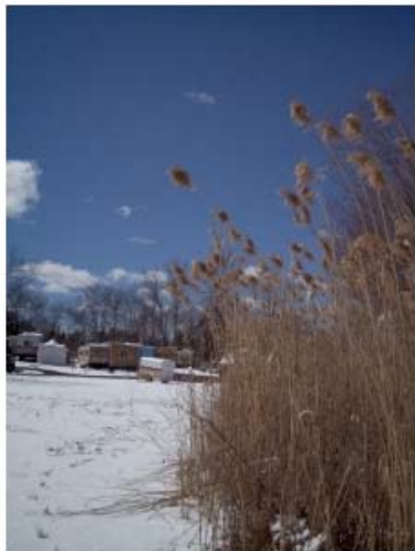
Challenge 2 reference photo: Pennsylvania Snow